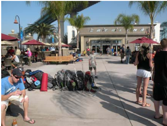
Catalina Express Terminal San Pedro